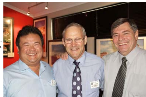
Airport Tax Payees (welcome home)